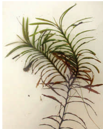
Robbin's Pondweed (native)

As a result of this study, an aquatic plant management committee was formed to address the concerns mentioned in the plan. In both 2009 and 2010, chemical treatments targeted areas of Eurasian water milfoil. In